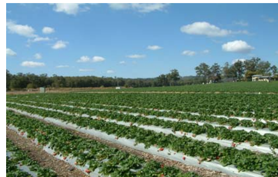
Fig.3. Fruit are exposed to weather conditions