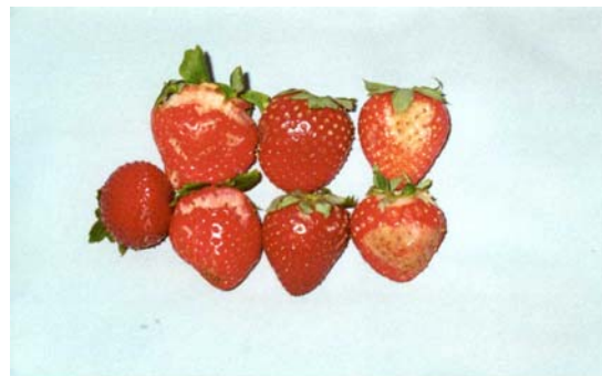
Fig.2. Rain-damage – cracking (L) water soaking, surface etching (R)